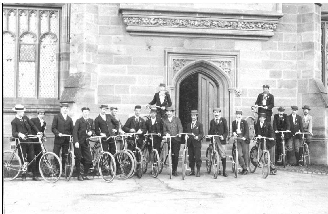
Opening run of the University of Sydney Bicycle Club, 1897. G3/224/1548

Sydney University Sport 1852-2007: More than a club offers a fascinating and highly informative overview of the history of sport at the University of Sydney. Sport at Sydney has had a complex and sometimes chequered history, with many clubs starting with promise, only to fold a few years later and perhaps to be revived many years later.