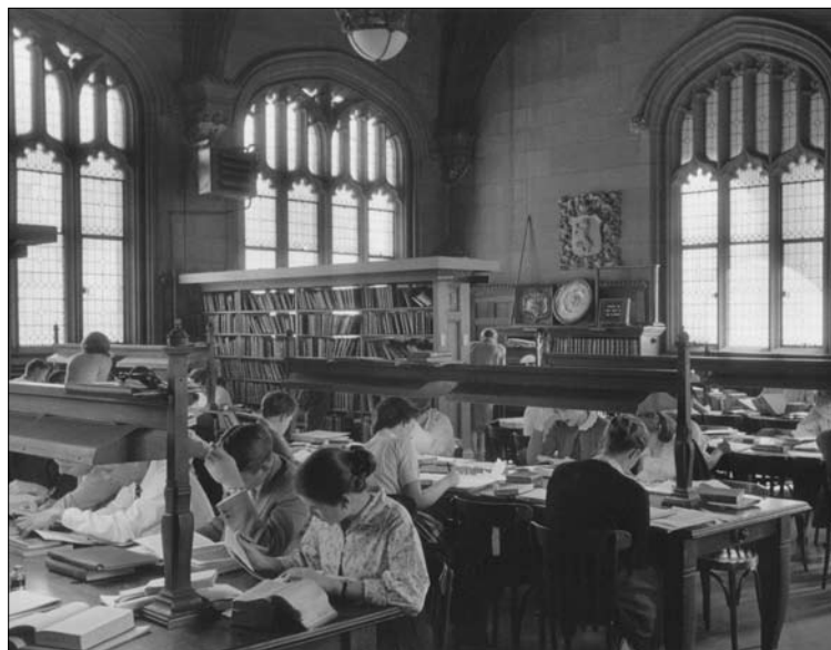
Reading Room of Fisher Library, now Maclaurin Hall, 1950s (G3/224/1723.2)

purchasing of new books and periodicals to proceed apace. When the bequest was received the collection stood at approximately 12,000 volumes. By 1886 it had grown to 18,000 volumes and some of the Stenhouse collection had had to be 'stored in cases in order to allow of more room on the shelves for newly purchased books.' 7 By the turn of the century the