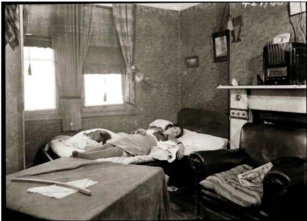
Fig 1: Female murder victim, c.1940s, details unknown.

left foreground a coat-hanger and a folded doily sits upon a deal table, covered with a cloth; in the right is a leather armchair with an unmatching cushion that blocks the fireplace. On the mantle-piece is a large wooden radio, beside it an ornate clock, turned so that the time cannot be seen from the bed. Hanging from the wall, there are two framed photos that look like landscapes, an ugly light with an uncovered bulb, and a small hand-sized American flag. The final touch, tossed casually on the armchair, is a glossy magazine, True Confessions ; its by-line: “I was the Town’s Bad Girl!”