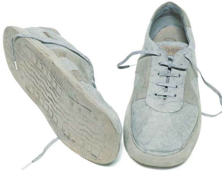
Ricky Swallow, Vacated Campers 2000 (binders board, paper, glue) 10 x 32 x 35 cm

Since the late 1990s, Melbourne-based artist Ricky Swallow has mined the forgotten junk of his childhood memory as the basis of a series of meticulously detailed, 1:1 scale models. Many of these models are crafted in the image of recently defunct technological toys and commodities from the 1980s, such as handheld computer games, 'ghetto blasters', cassette tapes, a metal detector and a BMX bike. 1 Meticulously constructed from binders board, glue, plastic tubes, craft-wood and paint, all of the objects – which are the result of several hundred hours of labour – are suggestive of the 'pass-time' of a hobby craftsman, or the mimetic forms of play enacted in a kindergarten. A more recent corpus of this series has been modelled after freshly obsolete commodity logos, such as the Apple Mac icon, the 2000 Apple Power book, a Game Boy, and a discarded pair of Campers brand sneakers. 2 All of these commodities once stood as icons of their time; they