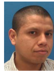
Head tilted to the side