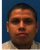
Photograph too dark