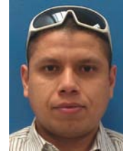
Glasses on head