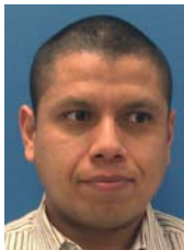
Looking away from camera