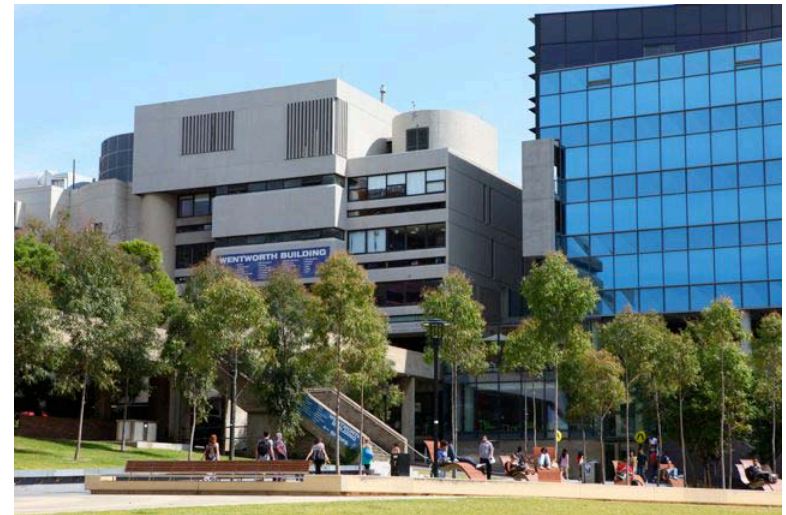
CET, Lvl 5 Wentworth Building