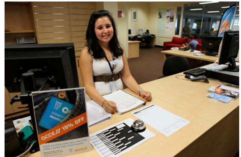
USU International Lounge, Lvl 4, Wentworth Building