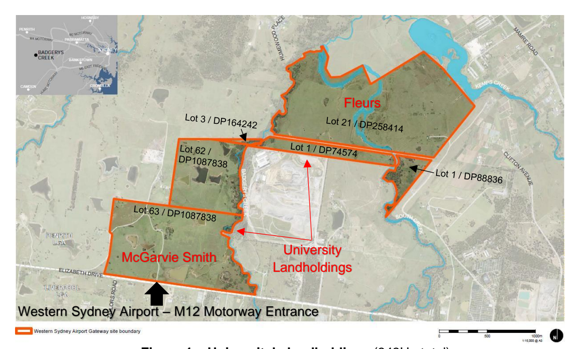
Figure 1 – University's landholdings (343Ha total)