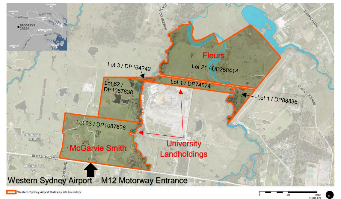
Figure 3 – University's landholdings (343Ha total)