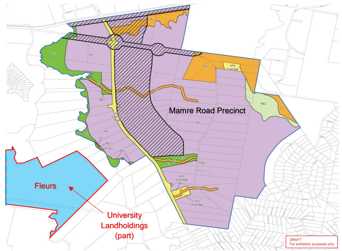
Figure 2 – Mamre Road Precinct DRAFT Land Zoning Map and University' landholdings (indicative boundaries)