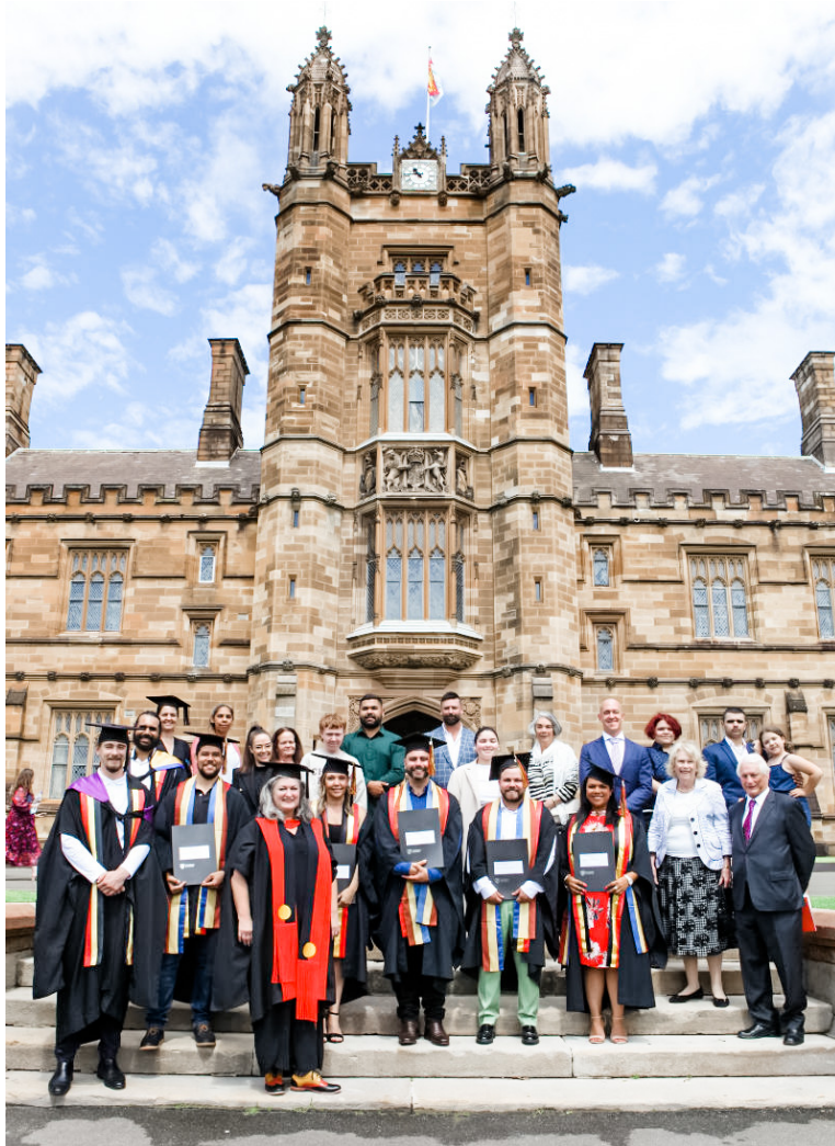
SEWB Graduates from the 2020/2021 cohort attending their graduation ceremony with family and friends (December 2021)

While individual graduation from the GDIHP clearly presents growing future professional development opportunities at a student /graduate level, the ripple effect on the health and wellbeing of communities and workplaces around Australia remains large.