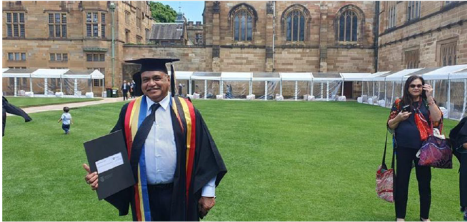
Graduates from the GDIHP cohort attending their graduation ceremony on 8 th December 2022 with family and friends