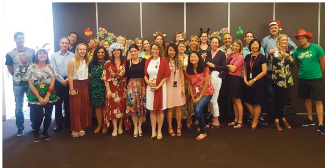
Prevention Research Collaboration 2017 Christmas Party.