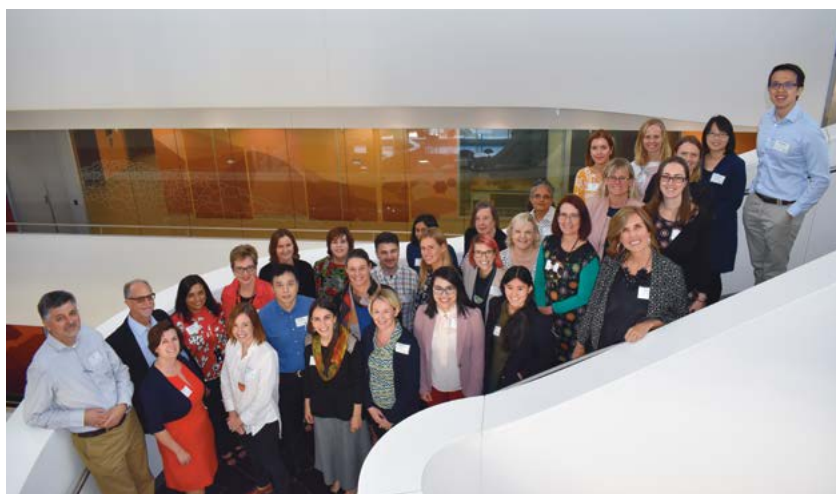
EPOCH CRE staff and students