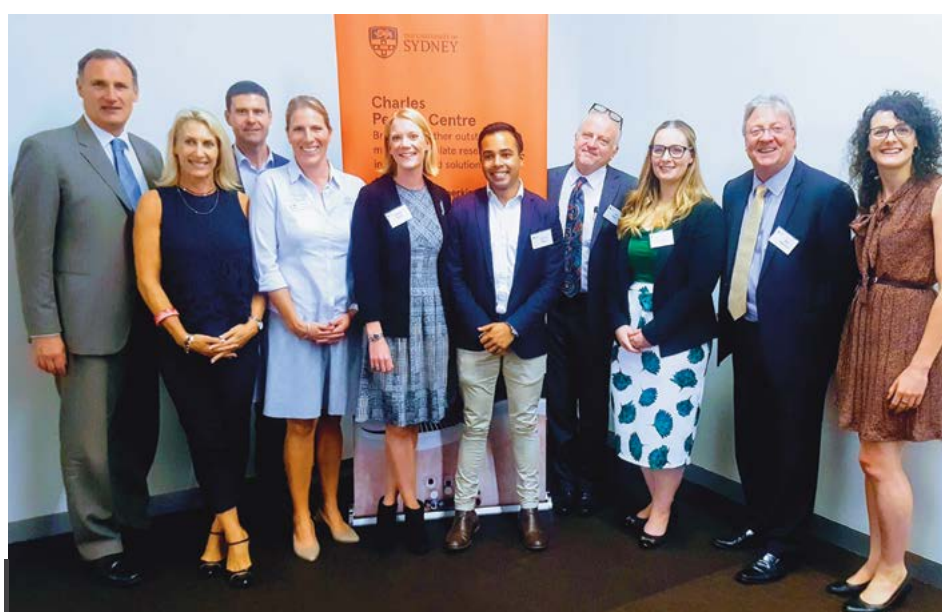
NSW Office of Sport and SPRINTER team