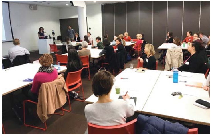
Participants at the Pragmatic Health Promotion Evaluation workshop

Participant, Pragmatic Health Promotion Evaluation training