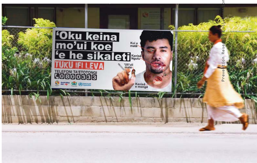
One of the Tuku Ifi Leva campaign materials in Tonga