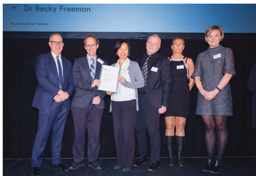
PRC awarded Outstanding Research Engagement and Innovation.

sydney.edu.au/medicine/public-health/prevention-research/news/publications.php .