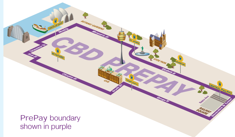
PrePay boundary shown in purple