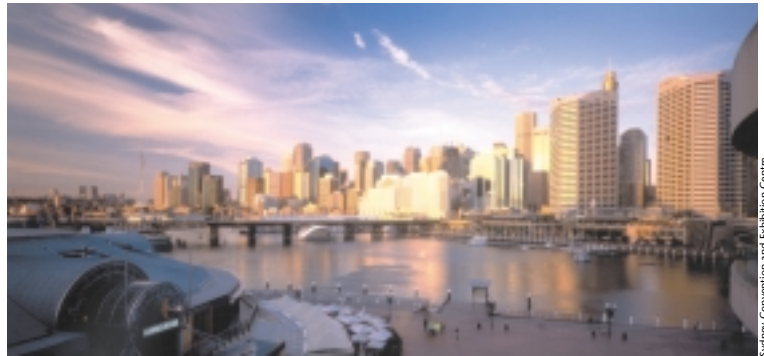
Sydney Convention and Exhibition Centre

The International Conference on Advances in Structures: Steel, Concrete, Composite and Aluminium (ASSCCA '03) is a result of the union of the 5th International Conference on Steel and Aluminium Structures (ICSAS) which was scheduled to be organised by The University of Sydney and the 7th International Conference on Steel and Composite Structures (ASCCS) which was scheduled to be organised by The University of New South Wales at the same time. These two universities, which are the largest in Sydney and two of the leading universities in Australia, are pleased to work together to produce the combined conference. The two Civil Engineering Departments of these two universities have a long history in structural engineering research of the highest standard and so it is only fitting that the combined conference is being organised by these two departments.