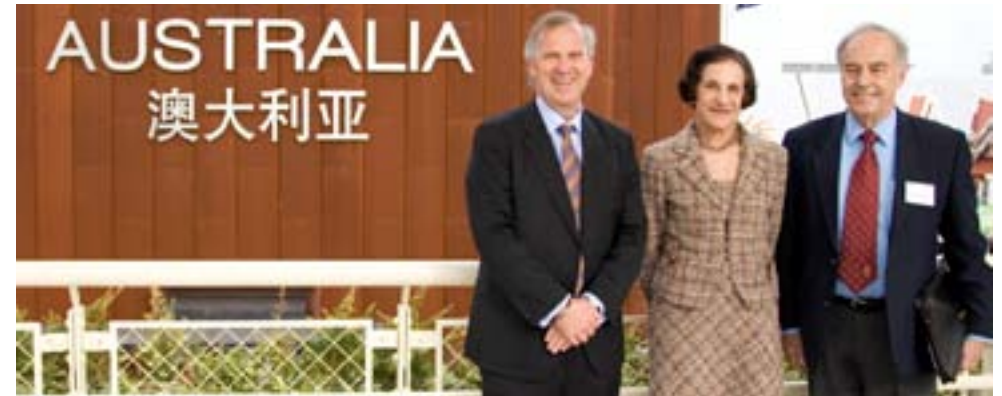
The Chancellor, Vice-Chancellor and Deputy Vice-Chancellor International outside the Australian Pavilion at the Shanghai Expo. The University was a gold sponsor of the pavilion.

The Deputy Vice-Chancellor International portfolio is one of five university-wide portfolios providing high level strategic leadership to the University. We aim to keep the University in the front rank of World Universities as a centre of learning, where current and future leaders can grow and thrive. It is in this global arena that the University will define its future national and international success. The DVC International portfolio team leads, coordinates and assists in the university-wide strategies, policies, programs and priorities for external international engagement and for internal internationalisation.