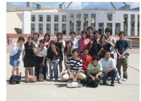
Students from last year's Canberra seminar.