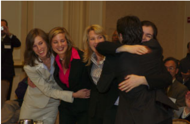
The winning moment