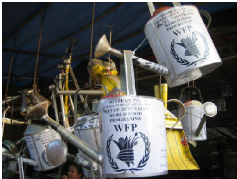
Australian food aid packaging reused in a Burmese market

Current or recently completed grants have supported research into shifts in Japanese commercial regulation, consumer credit, product safety, and the spread of infectious diseases. Publications, including public submissions, are listed in the Centre's Annual Reports; and many works by Associates can be found and freely downloaded via www.ssrn.com .