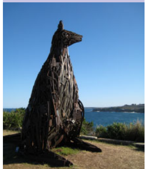
Nigel White, Wallaroo (2007) Sculpture by the Sea, Bondi