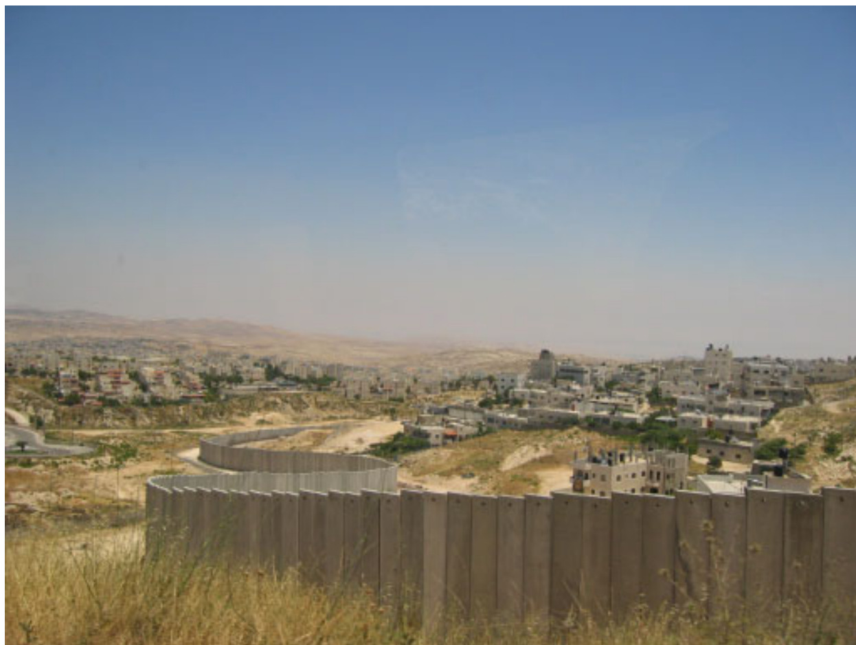
Israel's security barrier surrounding a Palestinian refugee camp on the outskirts of Jerusalem, May 2007