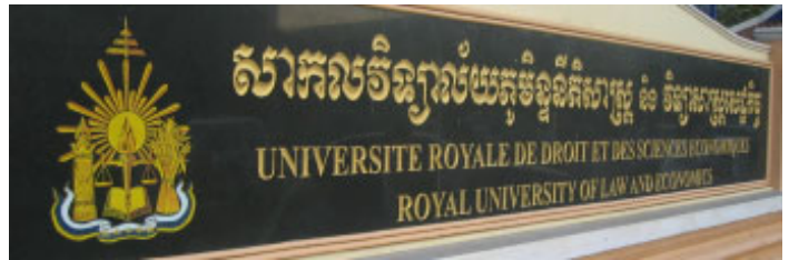
Phnom Penh, Cambodia