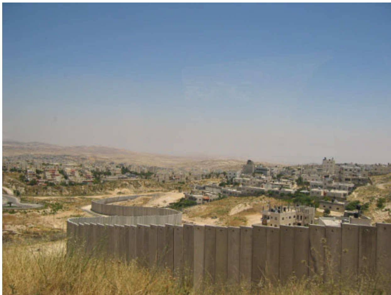
Israel's security barrier surrounding a Palestinian refugee camp on the outskirts of Jerusalem, May 2007