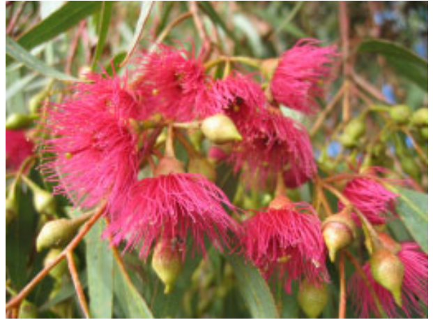
Flowering gum, University of Western Australia

'Federalism – Facts and Fallacies', ABC Radio National Perspectives , 7 May 2007