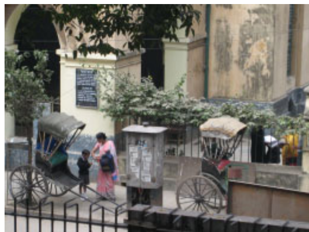
Kolkata (Calcutta), December 2007

'Climate Change, Water Security and Conflict in the Asia-Pacific', Faculty Overseas Conference Travel Grant (India)