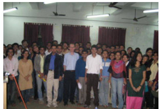
Centre Director (centre) with Indian law students in Kolkata

The book's policy perspective challenges international criminal justice to return to the more critical position justice has exercised in the separation of powers constitutional legality. For liberal democratic theory, judicial authority and its institutions have ensured constitutional legality by requiring the legislature and the executive to operate accountably against a higher normative order. This is not a predominant function of judges and courts in the international context despite their statutory invocation to this task. Case-studies of global crime and control reveal contexts in which the co-opted governance of institutional ICJ in particular, has a politicized motivation which too often advances the authority and interests of one world order against the legitimate resistance of criminalized communities. When the analysis moves to victim community interests, and to the appropriate global constituencies of ICJ, the nature and limitations of ICJ supporting governance in the risk/security model becomes apparent.