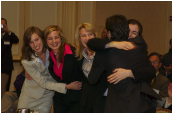
The winning moment