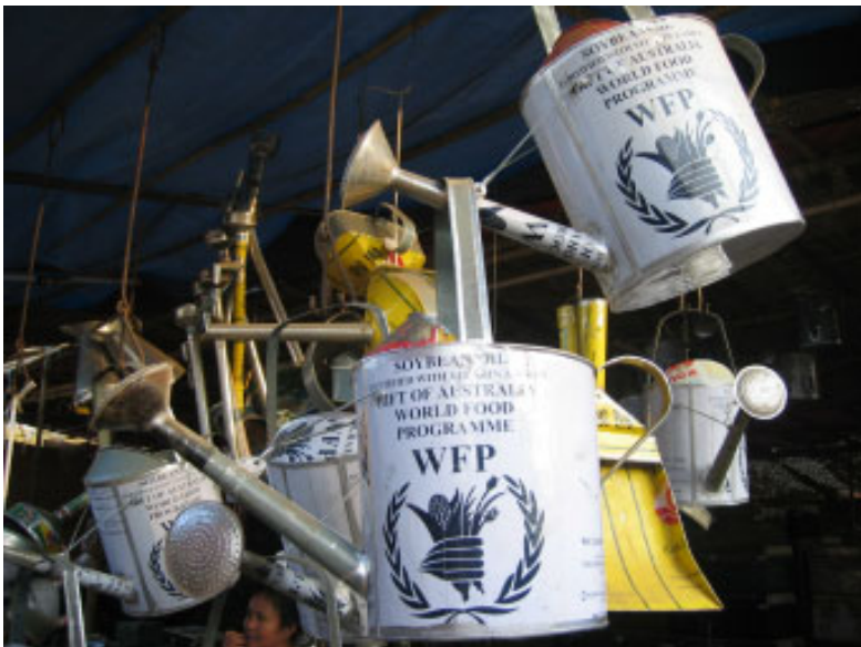
Australian food aid packaging reused in a Burmese market

Comments about the programme are welcome, as are possibilities for research collaboration. Please email brett.williams@usyd.edu.au or law.scigl@usyd.edu.au .