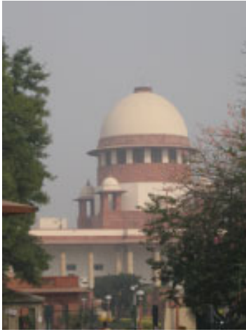
Indian Supreme Court, New Delhi

'Commentary on the 1993 Cambodian Constitution' (Royal University of Law and Economics, Phnom Penh), Asialink/Myer Weary Dunlop Fellowship