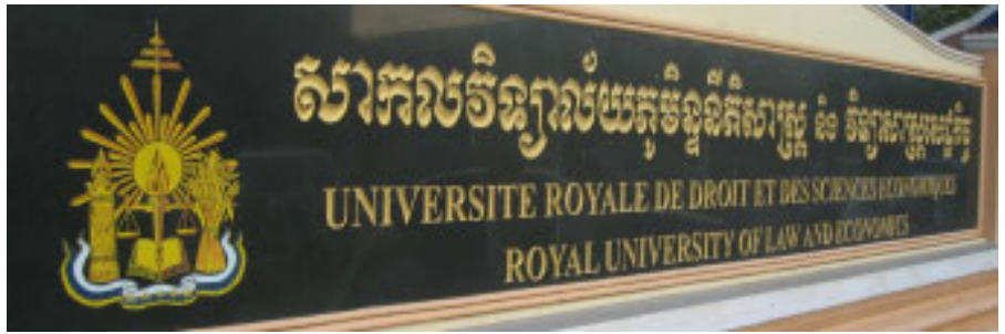
Phnom Penh, Cambodia