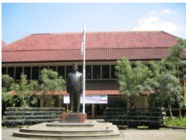
Faculty of Law, University of Indonesia, May 2007