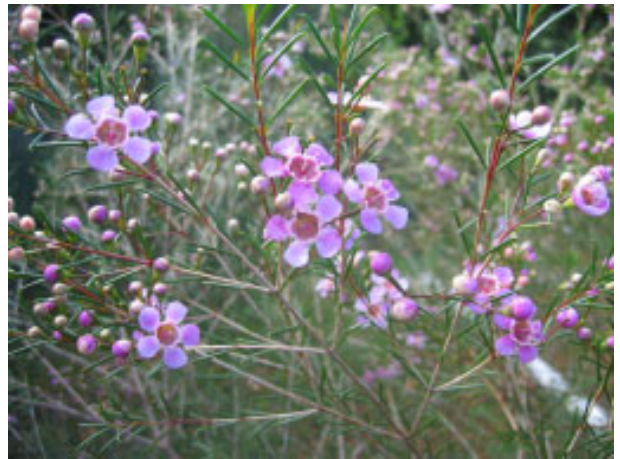
Geraldton wax, University of Western Australia