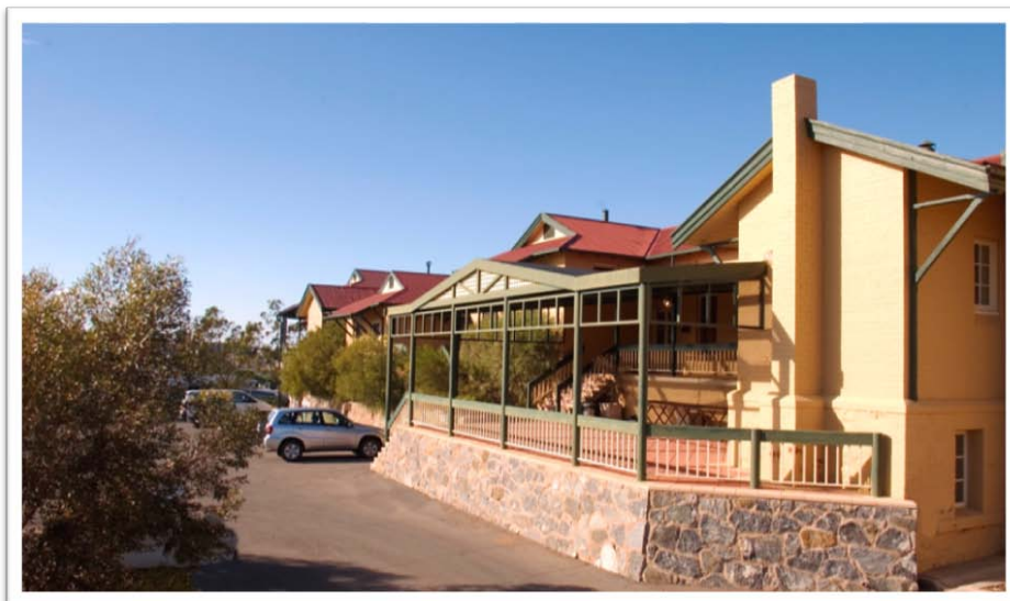
Broken Hill University Department of Rural Health Corrindah Court, Morgan Street