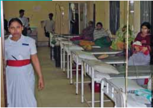
Hospital ward in Bangladesh

Foresight has added a special dimension to the activities of the SSI and the SSI's staff are included among those who are asked to visit East Timor and the near island nations.