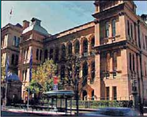
The Save Sight Institute is located on the historic site of Sydney's first hospital and shares this home with the Sydney Eye Hospital

Established on 6 May 1985, the Save Sight Institute is a not-for-profit organisation working with government and community to save sight. Its work and its vision provide a unique fusion of scientific endeavour, clinical excellence and community spirit!