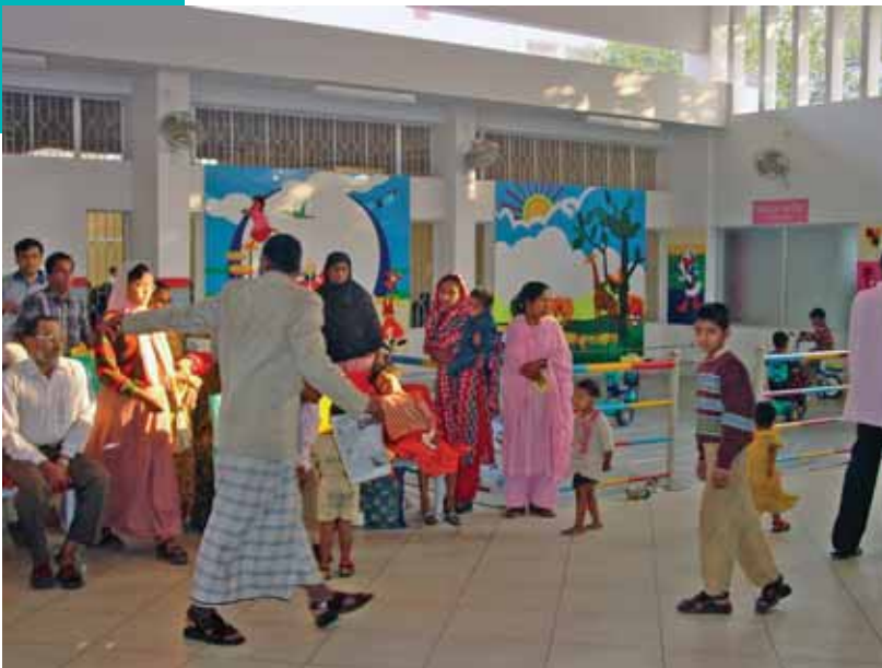
Waiting patients, Bangladesh

Diploma of Ophthalmology providing the necessary study and training for aspiring ophthalmologists in the South Pacific region as well as some countries in the Western Pacific area. The courses will be helpful in establishing local capacity in the field of ophthalmology and the prevention of blindness in the region.