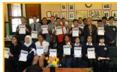
Julie Owens MP with Peer Leaders at Arthur Phillip High School, Parramatta

Analysis of 2015 evaluation data has commenced, and schools should expect reports to be delivered in Term 1, 2016.