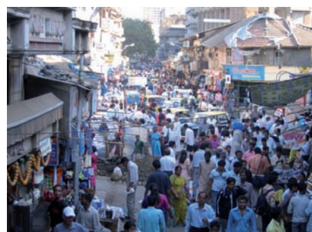
The noise and bustle of India