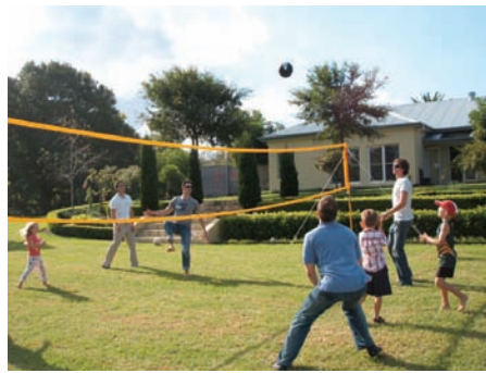
A bit of volleyball after lunch