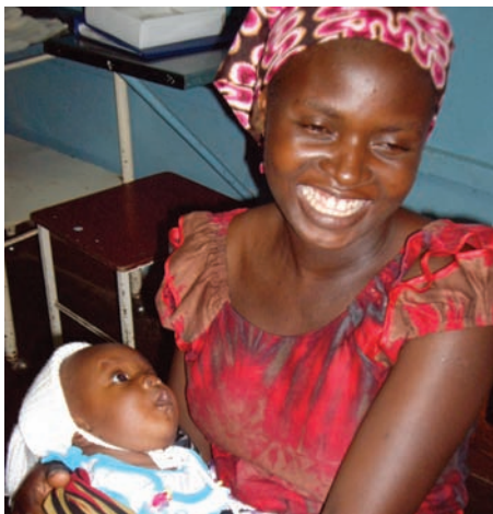
Zambia: Mother and daughter awaiting treatment

My elective was fantastic- it was an opportunity to explore another culture and safari through a beautiful country. It taught me so much about medicine, about life in the developing world and about myself. While it opened my eyes to the degree of suffering and despair that shapes the lives of those living in poverty and disease, it opened my heart to the love and resilience that flows from those who live this story day to day.