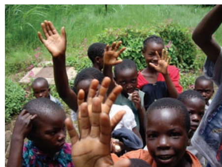
Zambia: A warm welcome from the local children