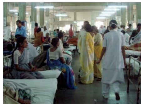
A typical ward at King Edward Memorial Hospital