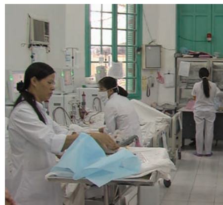
The dialysis department in Hanoi

At the end of my elective period, I travelled around Vietnam for two weeks and was lucky to spend the Lunar New Year celebrations in Saigon. The whole country went on holiday and there were floral displays and fireworks all over the city. It was the perfect end to an excellent trip.