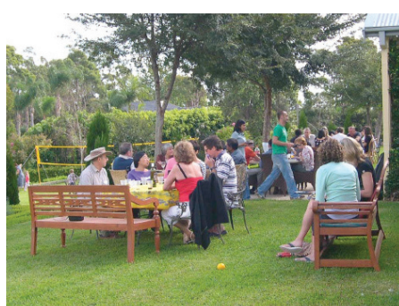
The crowd at Terrey Hills