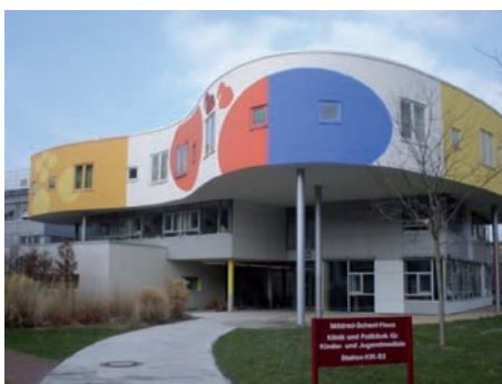
The Children's Clinic, Dresden

There is also much that is non-medical to do in and around Dresden. There are numerous playhouses and theatres, including the world famous Dresden State Semper Opera. Swiss Saxony is a beautiful area of hilly forest just east of Dresden with numerous hiking and biking trails. Furthermore, Dresden is located on the major European train line that connects Berlin to Prague, Vienna and Budapest and is close to the border with Poland.