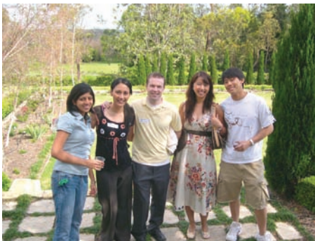
Med students enjoying the day