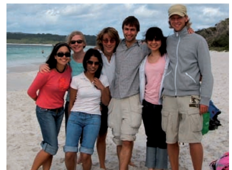
Dresden students and friends at Jarvis Bay