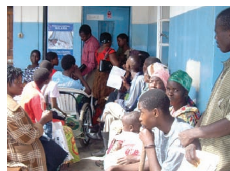
Patient line at the clinic