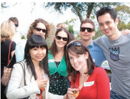
The sunglass gang