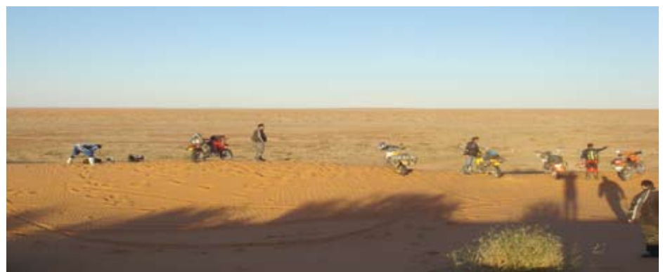
Taking in the view

For the next adventure we have our eyes set on the croc-infested mangroves of the Cape York Peninsula. This time we will raise some money for a good cause. All are welcome!