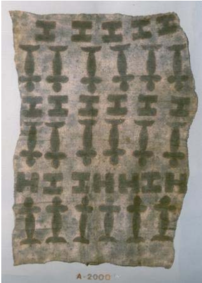
Barkcloth from Santa Isabel Island, Solomon Islands

The barkcloth shown here is one of fifty-two barkcloths in the Macleay Museum. Indigo-blue in colour, it is decorated on one side with H-shaped motifs and designs possibly representing stylised fish in a deeper blue outlined in a reddish-brown colour. The barkcloth is approximately 160 x 110 cm. It comes from the Solomon Islands to the north east of Australia and is similar to barkcloths from Santa Isabel Island.