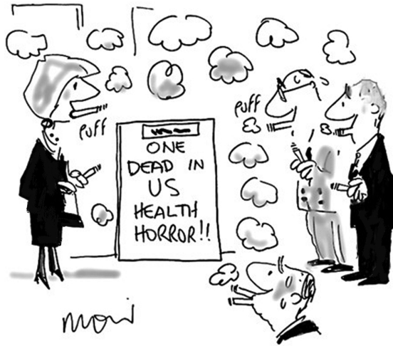
Figure 31.1 A cartoon by Alan Moir, published during the 2001 anthrax scare. Courtesy of the artist.

Alan Moir published a cartoon in the Sydney Morning Herald in the first days of the anthrax mailings in the USA (Figure 31.1). It showed a group of smokers reading the banner coverage of a single death attributed to anthrax. As we go to press, five people have died as a result of anthrax inhalation. An anti-smoking poster plainly appropriating the New York twin towers outrage featured a simple call for “No more killing”, and showed two upturned cigarettes burning in the shape of the World Trade Center before their collapse (Figure 31.2). Produced in Hong Kong by graphic artist Michael Miller Yu and designer Eric Chan, tobacco-control groups there and elsewhere refused to endorse it, branding it as gratuitous, “cheap, sensationalist and 100 percent exploitative”. 10 The chair of the Hong Kong Council on Smoking and Health (COSH), Professor Tony Hedley, with an understandable eye toward such sentiments, said, “We want people to look at tobacco deaths on their own merits”. 11