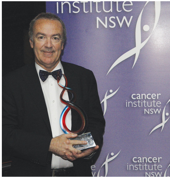
The author in 2008, receiving the NSW Cancer Institute Award for Outstanding Cancer Researcher of the Year.

I always thought it right to review at least as many papers as I was writing myself. Most papers you get sent are answering questions that will make no difference to anything important, some need euthanising, and a few are destined to be critical bricks in important knowledge walls. So I still review, but only those that emit that early fragrance from their abstracts.