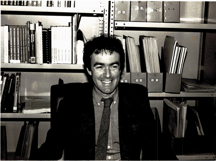
The author at 30.

When you stop drawing a salary, your curiosity about those questions does not suddenly switch off. You don't suddenly have an epiphany, as you might if you had worked in the Venetian blinds industry, that you just no longer have any interest in what you did every day for the last 40 years. But your appetite for setting out to answer these questions reduces, and so you focus only on those in which you are passionately interested and which can be researched without a team of funded colleagues. Here free data obtainable from the internet open up many possibilities.