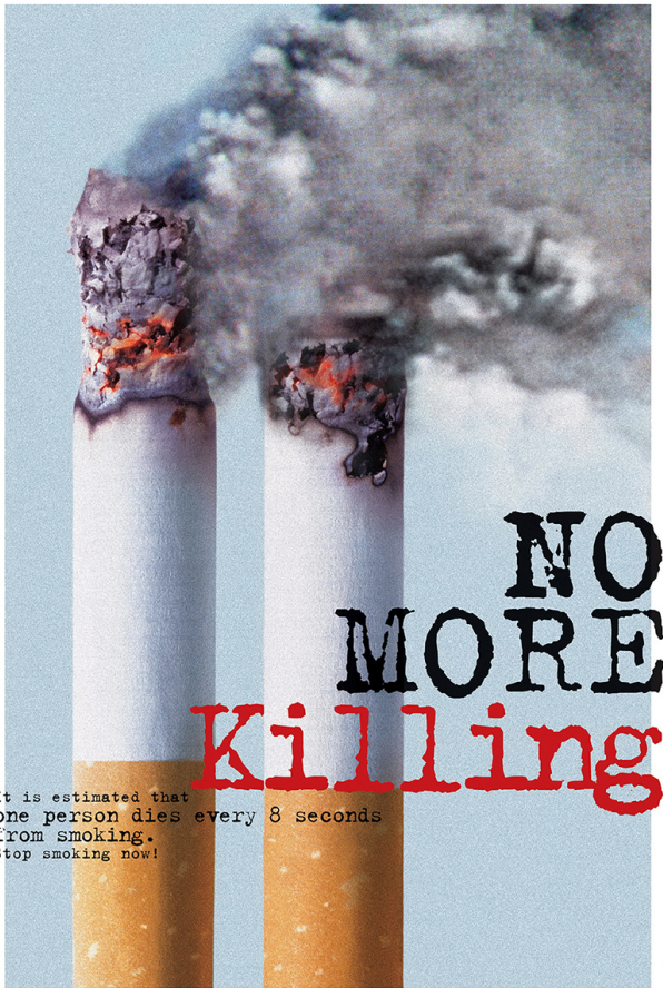
Figure 31.2 Anti-smoking poster by Hong Kong graphic artist Michael Miller Yu and designer Eric Chan. Local tobacco control groups refused to endorse it. Courtesy of the artist.