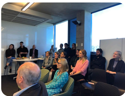
Audience at the 2019 Three Minute Thesis Heats for Sydney Medical School