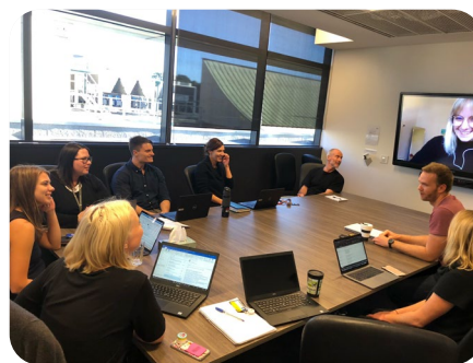
PhD group meeting, 2019

Monthly meetings provide members with the opportunity to meet, share ideas, openly discuss any issues and troubleshoot difficulties. In addition, students have the opportunity to practice presentations, attend specialised workshops, and be exposed to a diverse range of ideas and approaches. Students who are not physically located at the Matilda Centre can join meetings via our videoconferencing facilities.