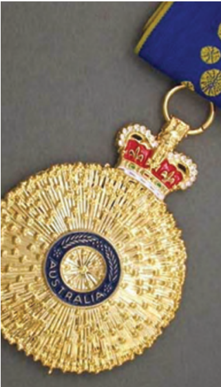
Order of Australia