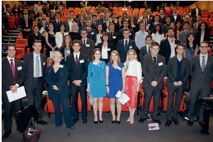
Our 2015 prize winners

More than 200 attendees, including prize winners and their families, as well as faculty staff, gathered in the Law School Auditorium for the annual event held to celebrate and recognise our talented students.