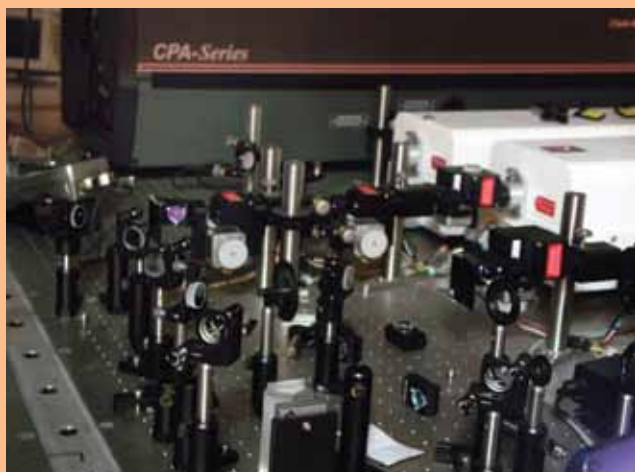
Figure 1. Sydney's ultrafast spectroscopy laboratory in action.

Using light paths in the lab, we can use micropositioning stages to accurately control the time delay between two laser pulses, at femtosecond resolution. This is the basis of femtochemistry (ultrafast spectroscopy), where one endeavors to watch molecules in action on ultrafast time-scales.