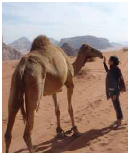
In Wadi Rum desert with camel