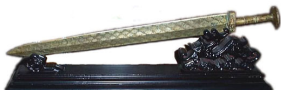
Figure 2. The sword of ‘Gou Jian’

The following case will be developed as an introduction to atomic and nuclear physics. In the end of 1970s, there was a famous sword named ‘Gou Jian’ found in the tomb of Yue King in Hu Bei Province in China (Figure 2).