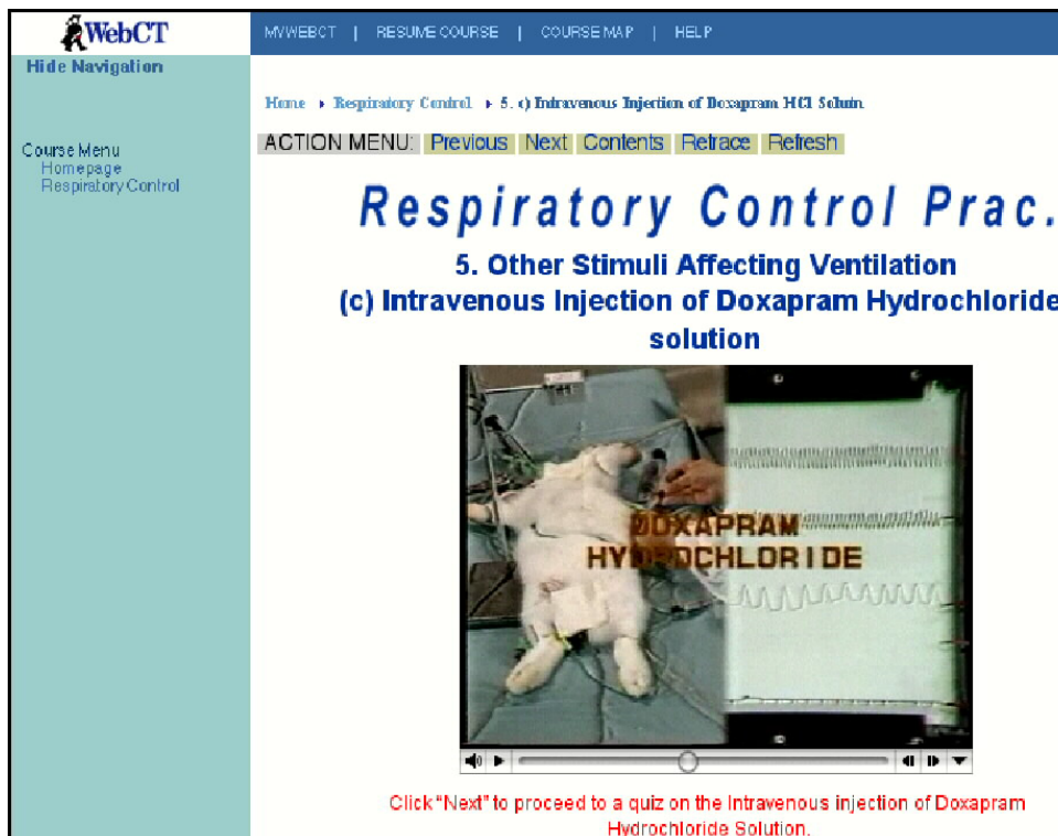
Figure 1. Traces showing the effect of intravenous injection of doxapram hydrochloride on ventilation

Use was made of the already existing video of the practical which was developed to reduce the need for animal experimentation, eg the rabbit in this case and thus replace animal-based learning. When designing the flexible learning environment, care was taken to develop domain specific educational strategies. These include demonstrating the experiment, section by section in the form of streaming videos, dependent on QuickTime Apple technology (Figure 1), followed by quizzes on each segment of the practical.