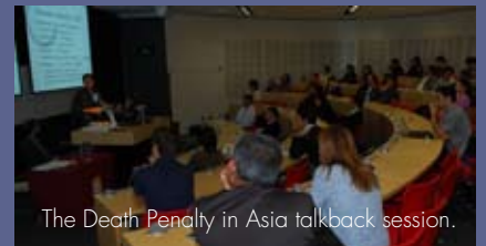
The Death Penalty in Asia talkback session.