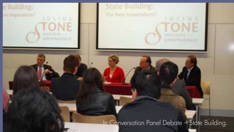
In Conversation Panel Debate – State Building.