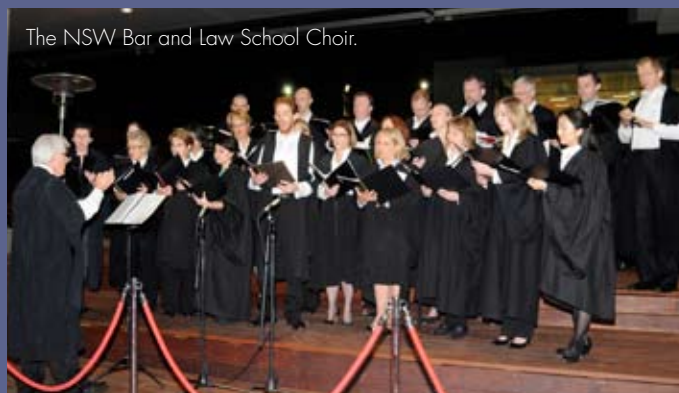
The NSW Bar and Law School Choir.