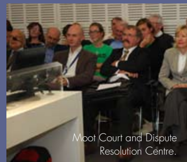
Moot Court and Dispute Resolution Centre.