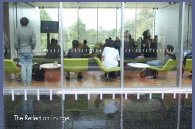
The Reflection Lounge.