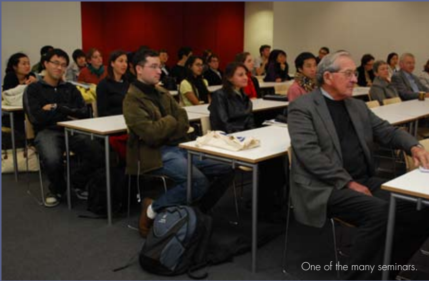
One of the many seminars.