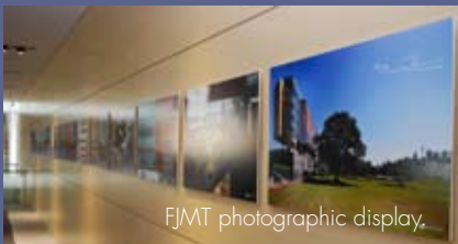
FJMT photographic display.