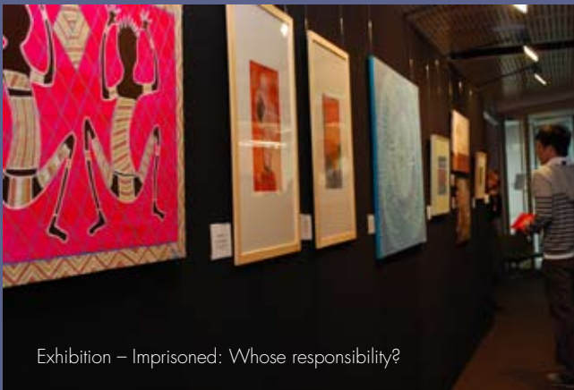
Exhibition – Imprisoned: Whose responsibility?