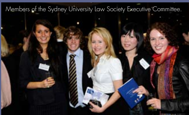
Members of the Sydney University Law Society Executive Committee.

We wish to thank all donors to the Sydney Law School Building Fund, and in particular Principal Supporters: Allens Arthur Robinson, Clayton Utz, Freehills, Macquarie Group Foundation and The Turnbull Foundation.