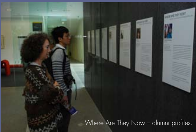
Where Are They Now – alumni profiles.