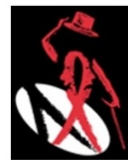
HATS OFF! 22 FEB