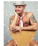
QUEER THINKING 26 FEB