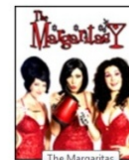
ON THE ROCKS 25 FEB-6 MAR