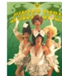
EACH HIT AND I 2-6 MAR