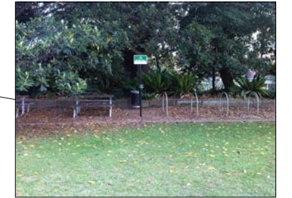
QUADRANGLE & LIBRARY PRECINCT