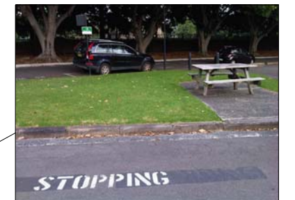
CITY ROAD PRECINCT