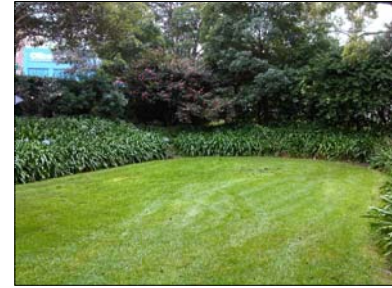
ROSS ST. PRECINCT