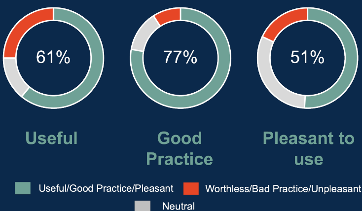
Figure 2. Frequency of respondents based on their responses regarding questions pertaining to the usefulness and pleasantness of deposit limits.