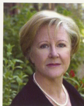
Professor Gillian Triggs

PROFESSOR GILLIAN TRIGGS, AN EXPERT IN INTERNATIONAL LAW AND A BARRISTER IN THE VICTORIAN SUPREME COURT, HAS BEEN APPOINTED THE NEW DEAN OF LAW.