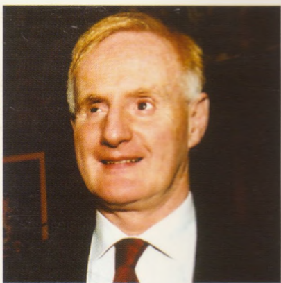
Professor Ron McCallum AO