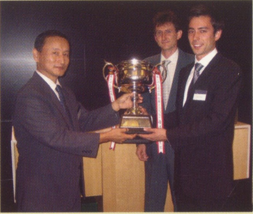
The President of main sponsor, JCCI, re-presenting the trophy

THE LAST EDITION OF THE SYDNEY LAW SCHOOL REPORTS REVIEWED THE ACTIVITIES OF THE AUSTRALIAN NETWORK FOR JAPANESE LAW (ANJEL, WWW.LAW.USYD.EDU.AU/ANJEL ) IN THE 2006 AUSTRALIA-JAPAN YEAR OF EXCHANGE.