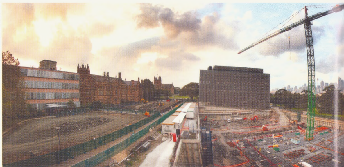
The site in context of the main campus, taken from City Road.