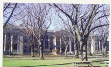
Harvard Law School

"In this globalised world, student exchanges of this nature provide invaluable opportunities. They lead to broader understanding of the law, foster international friendships, and build transnational networks of students and scholars."