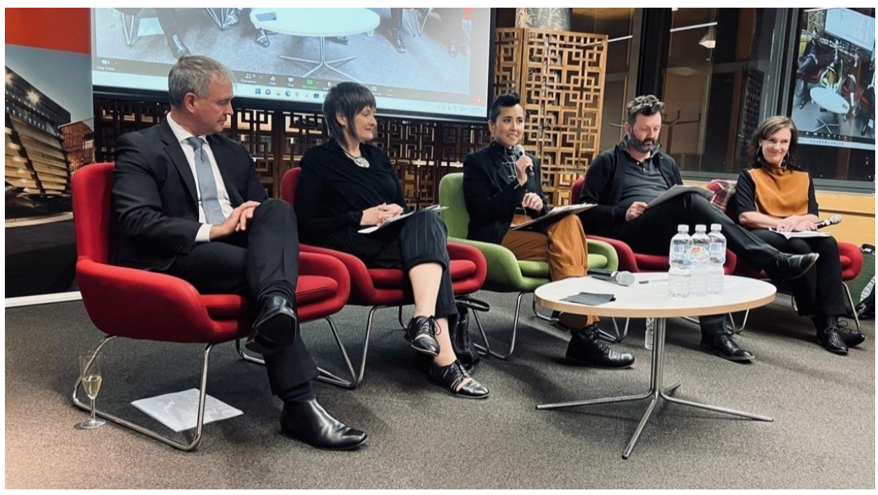
Pandemic Policing Panel, 2022