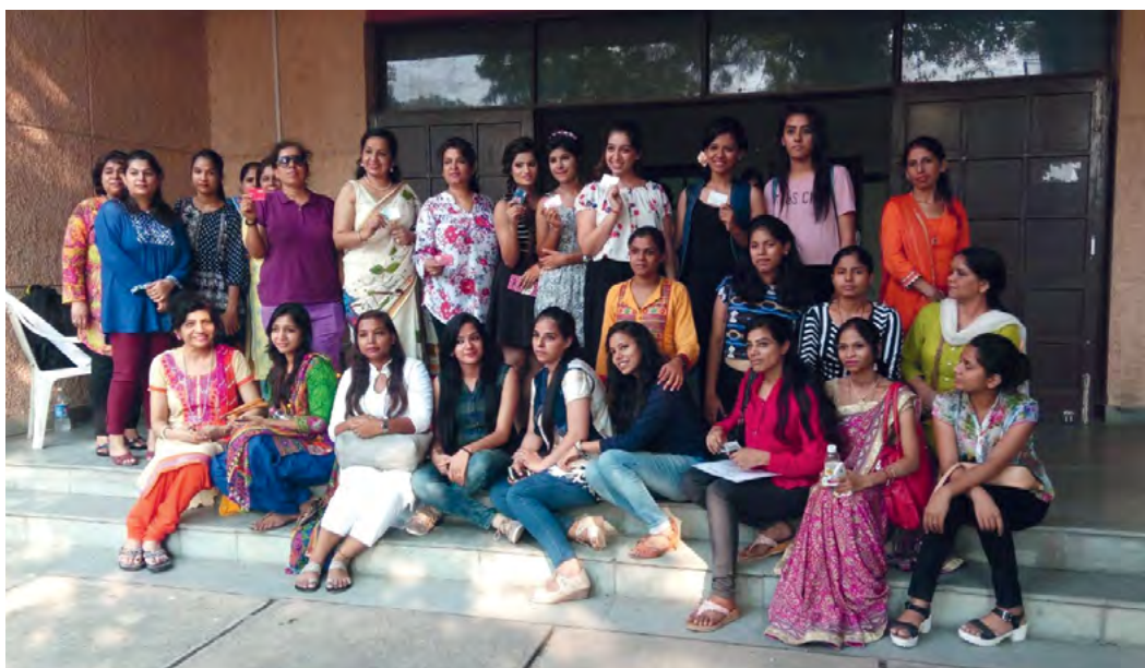
Image: Students and faculty of Janki Devi Vocational Centre in New Delhi join Beauty & Banking facilitators after a workshop. Featuring two student models and everyone equipped with payment methods.

I drew my inspiration for this project from my own difficulties with opening a bank account in India after demonetisation. In designing Beauty & Banking , I realised the key difference between me and the thousands of conflicted salon workers was my ability to obtain and apply the information in order to help myself. While the government established new technologies and schemes following the shock, the gap lay in communication. For many girls, asking for help translated to 'being annoying to someone else' or 'doing something they were never made for'. Through this process, I discovered that socioeconomic and educational differences are often entrenched through lack of awareness and opportunity – after all, how do you know what you don't know? And how can you learn what you don't know exists?