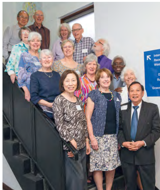
Image right: Alumni from 1967-1970 return to IH for the Pioneers' Lunch.