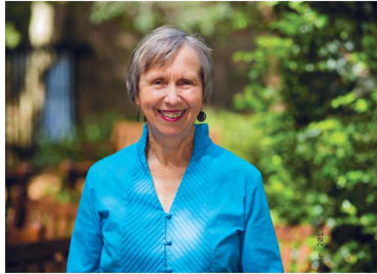
Issue #04, December 2011

What a wonderful celebratory 50th anniversary year it has been – with more to still come as this magazine goes to press.