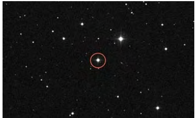
\alpha -Centauri the star closest to Earth.

While a sail is being accelerated by the laser beam, it is very sensitive to small variations in the laser intensity. The distances are so large and the speed so high that any active feedback control of the laser is too slow—by the time the laser has corrected the beam and the light has reached the sail it will be too late. The sails therefore need to be self-stabilising. There have been different approaches discussed in the literature, but these lead to a side-to-side motion of the sail. Damping this sideways motion is very difficult, and no solutions have been reported. Any solution to this problem requires the sails to have internal degrees of freedom, i.e., not to be stiff, for example it needs to be able to flap and thereby absorb the energy of the sideways motion. However, calculating the three-dimensional motion of such objects is challenging.