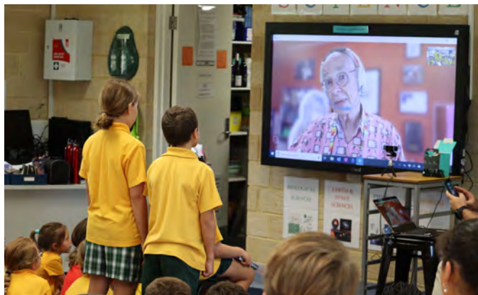
Newborough Primary Q&A

Dr Karl filmed a Covid-19 explainer video for University of Sydney social media channels and wrote and recorded a revelatory five-part lecture series for a new first-year class in the Open Learning Environment Unit Sustainability: Climate and Energy.