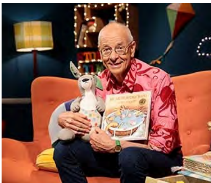
Dr Karl read the very apt 'Mr Archimedes' Bath' by Pamela Allen that illustrates water displacement for ages three and up!