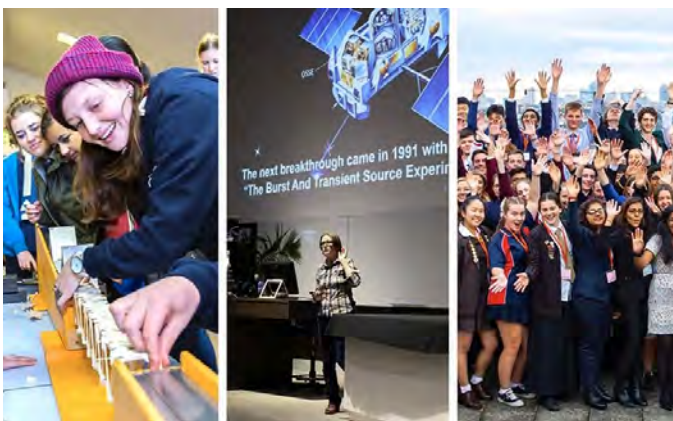
The full in-person ISS experience will return bigger and better than ever in 2022

The ISS Online program will provide a stimulating, inspiring and enjoyable week of science talks and activities for talented senior high-school students.