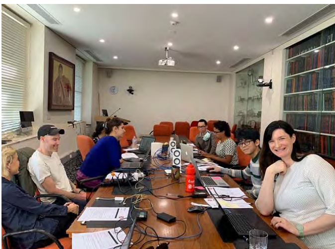
School of Physics team supporting Grand Challenges 2020 Presentations.

An innovation this year was for the projects to demonstrate the capacity to attract new research students, and also to indicate how undergraduate students could be included in activities, with a view to encouraging them to continue with a career in physics.